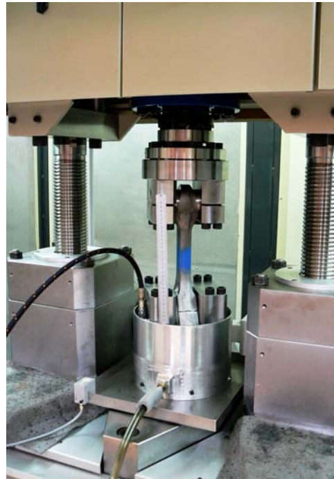
Special device for connecting rods