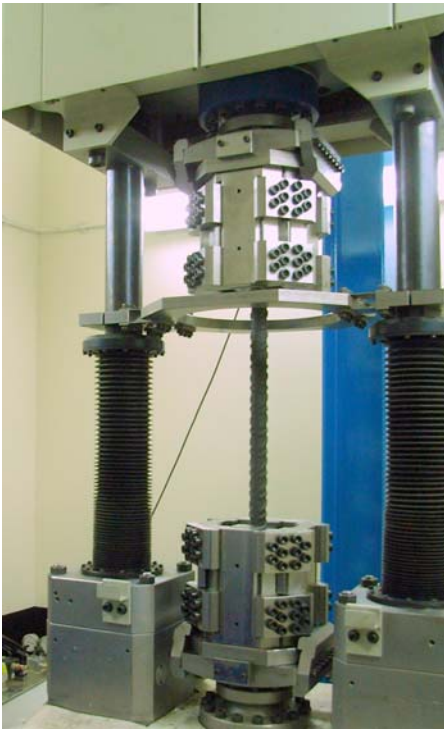
Tests on rebars with hydraulic clamping device PowerGrip 500 kN