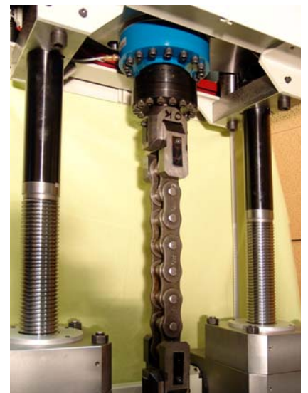
Chain testing gripping device